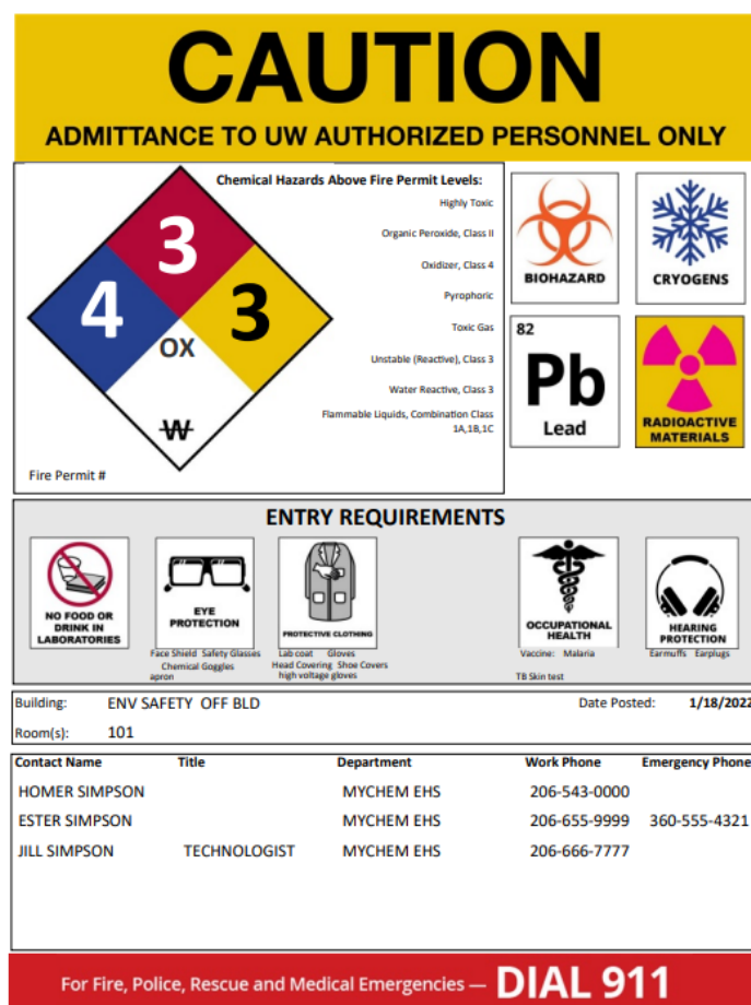
Figure 4-1 Example Laboratory Caution Sign

An example of the sign is shown in Figure 4-1 below. More information on the contents of the signs is available on the Caution and Warning Signs webpage .