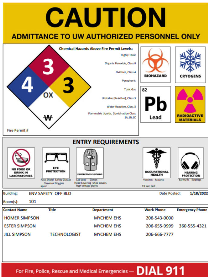
Figure 5-1 Example Laboratory Caution Sign

An example of the sign is shown in Figure 4-1 below. More information on the contents of the signs is available on the website.